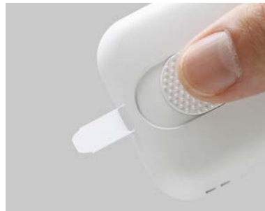
Test strip disposal lever