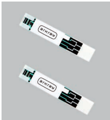
Test strip for GLUCOCARD™ W